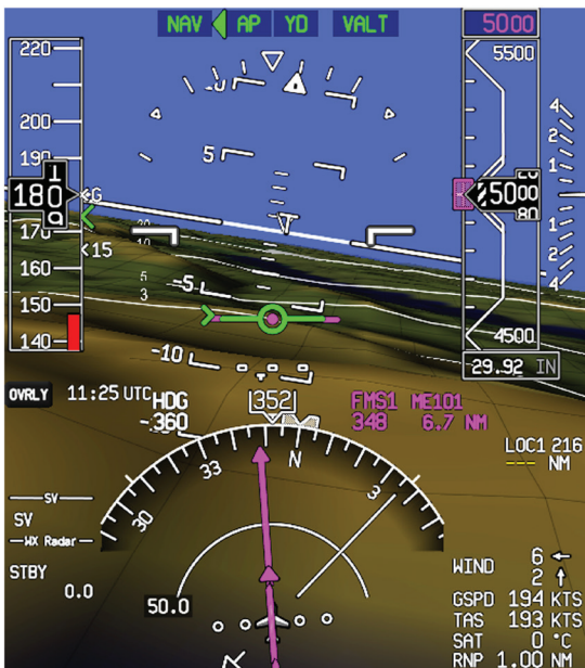
SmartView™ Synthetic Vision